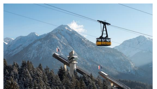
Figure 1: The real-world Cable Car situation

Weight empty cabin: 1600 kg Weight full cabin: 3900 kg Height valley station: 1933 m Height top station: 2214.2 m Horizontal difference: 905.77 m Speed: 8 m/s Carrying capacity: 500 people/h Power Unit: 120 PS